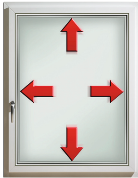
The glass pane is set into the frame and centred.