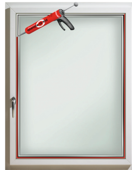
The remaining gap between glass and frame is filled with glue all around.