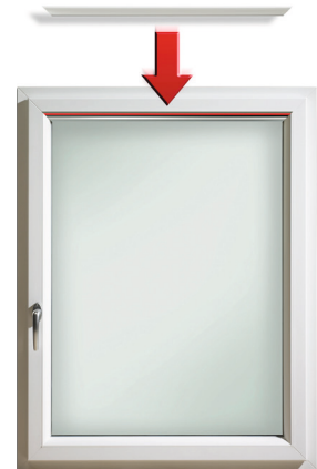
By fitting glass beads or cover beads the glue joint is covered.